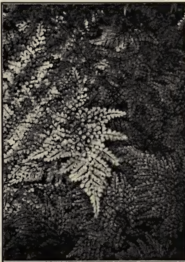
Adiantum venustum in the author's garden.

smooth and shiny above, the color dark brown to almost black. The blade above is triangular-ovate in outline. The entire frond is usually from six to twelve inches in length, although the author has encountered numerous fronds in the garden 18 inches long! The fronds are tripinnate to quadripinnate and decumbent. The old fronds remain attached until some time after the new growth appears. The pinnae are alternating and bipinnate. The pinnules are cuneate at the base, rounded at the apex and slightly cleft. New fronds are a rosy bright green con-